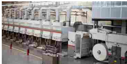
PULP AND PAPER MILLS