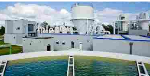
WATER AND WASTE WATER

Our vertical hollow and solid shaft motors are UL certified for NEMA Premium Efficiency and Construction, with models ranging from 7.5 hp to 1000 hp to serve a wide range of industrial and agricultural applications.